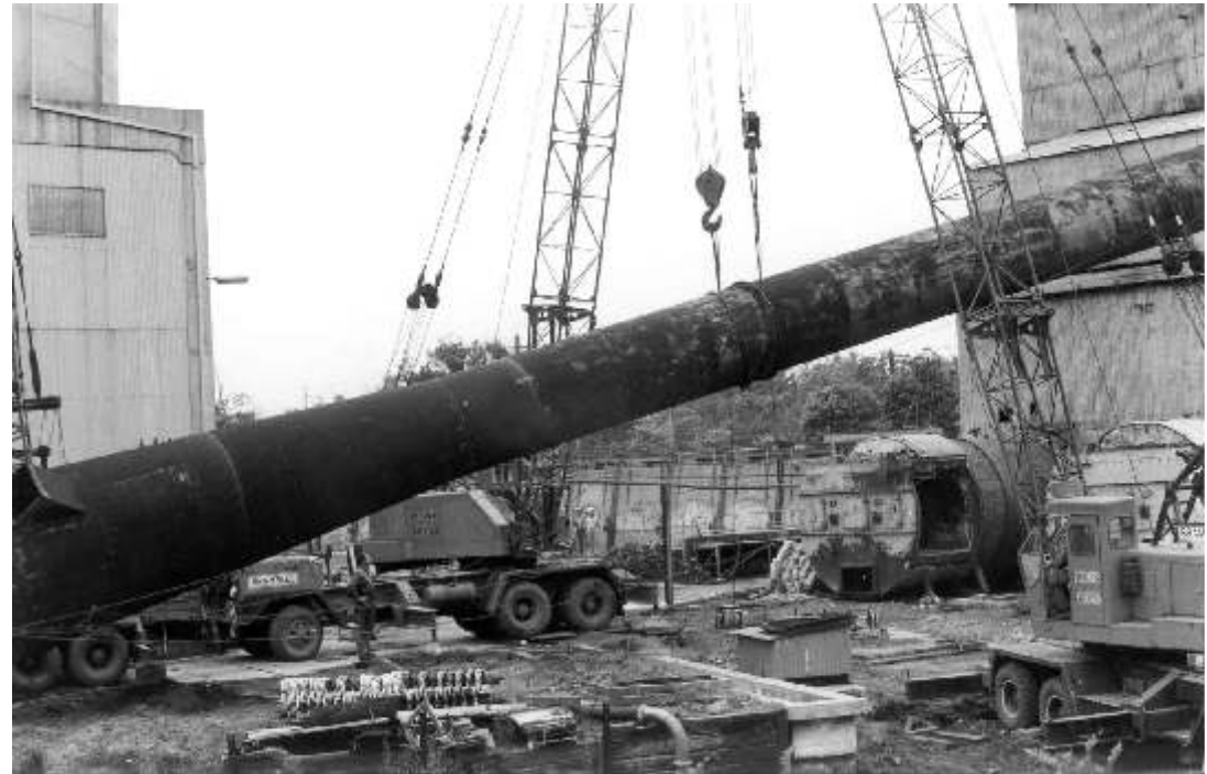
The boilers and stacks were removed from Corrimal Cokeworks when the on-site power house was closed and dismantled in January 1968

"Local Illawarra companies have long been associated with the Corrimal Cokeworks site. For example, the photo-