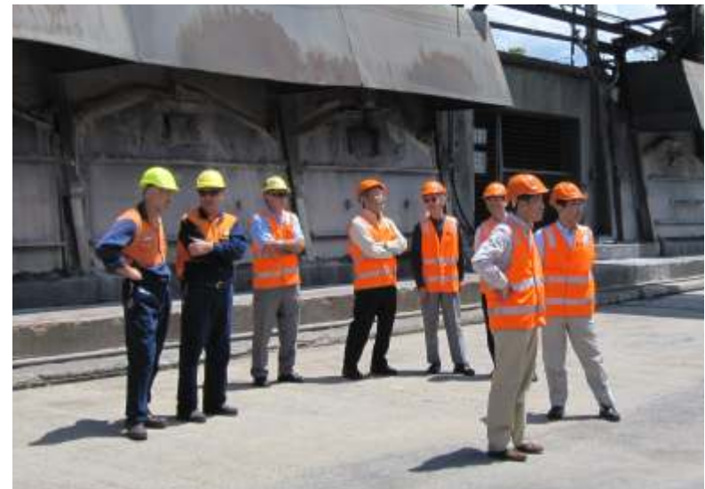
A delegation from Mitsui Mining & Smelting Company, Japan, during their visit to Corrimal Cokeworks

Mitsui Mining & Smelting Company produces prime western-grade zinc (minimum purity of 98.5 per cent) used mainly for the construction sector; and special high-grade zinc (minimum purity of 99.995 per cent) which is used in galvanising steel, vehicle components and in pharmaceuticals, etc.