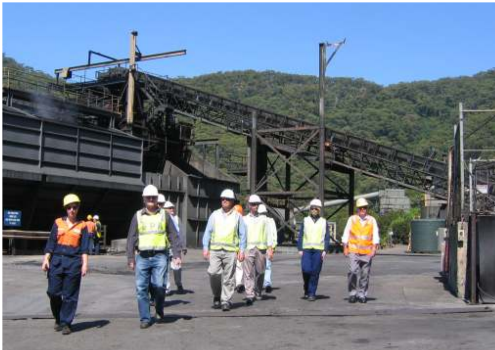
A delegation from the NSW Department of Environment, Climate Change & Water during a visit to Coalcliff Cokeworks

THE Illawarra Coke Company (ICC) was pleased to host a visit by representatives from the NSW Department of Environment, Climate Change & Water (DECCW) in late February 2010.